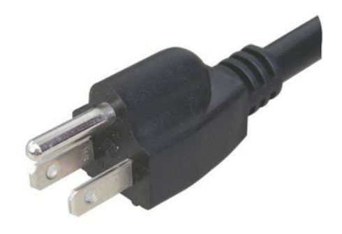
Plug with ground pin for a grounded tool

Symbol for "Double Insulated" tool (square inside a square)