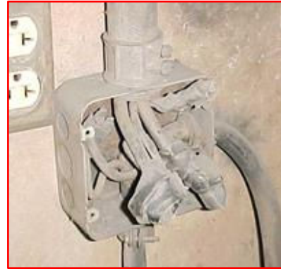
Missing Cover over Junction Box