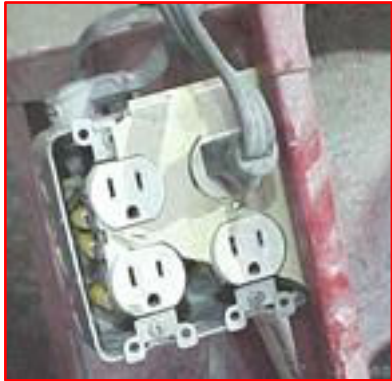
Broken Cover over Receptacle