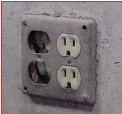
Loose / Recessed Receptacle