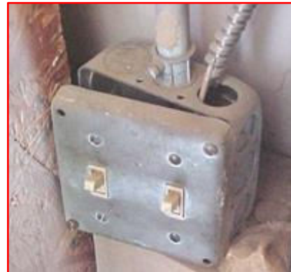
Missing Conduit "Knockout" and Loose Switchbox Cover